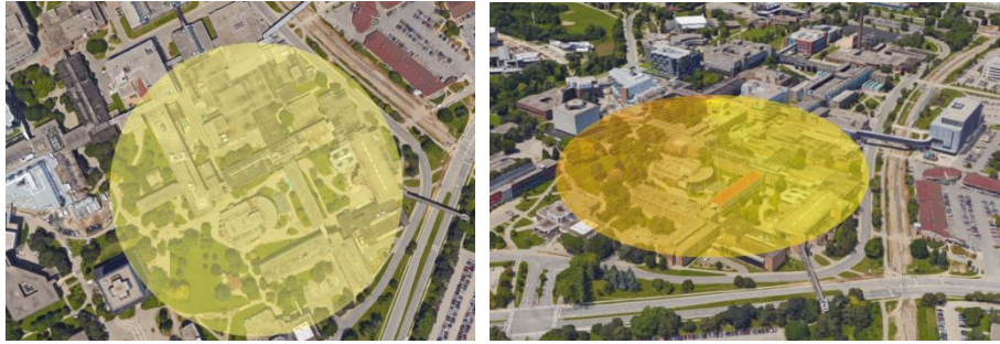
Figure 5. The equivalent pile of sand to 11.7 mC.

Now, some of the leading low-power circuitry today uses on the order of a femtoampere (fA), in which case, this is a pile of sand approximately 13 mm across and 4.4 mm high being sent per second or 0.2 mL of sand per second.