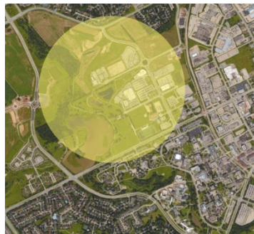
Figure 4. The size of a pile of sand equivalent to one coulomb.

so almost exactly one coulomb per second. So much sand would create a pile over 1300 m across and 400 m high. Such a sand pile would fit comfortably within the north campus of the University of Waterloo and be more than nine times the height of the Dana Porter library, as shown in Figure 4.