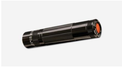
Figure 3. The MAG-LITE XL200 LED flashlight.

Now, my favorite flashlight, the MAG-LITE XL200 LED, shown in Figure 3.